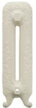
Parchment White Height 595mm