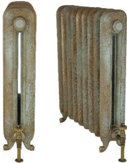
Vintage Copper Height 780mm